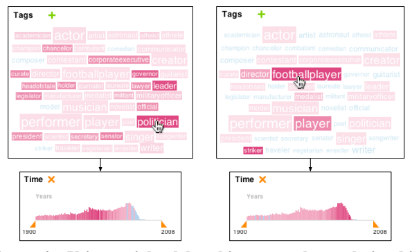
Figure 4: Using weighted brushing to explore relationships between occupation and age of famous people on Wikipedia.

To aggregate information about famous people from Wikipedia, the VisGets system requests data subsets from the DBpedia endpoint. In the current prototype, data is cached in a MySQL database, since SPARQL queries are often too slow for responsive interaction. Furthermore, the SPARQL standard does not yet provide query methods that can be used for visual aggregations. Because DBpedia does not provide a cache invalidation mechanism, cached entries are regularly updated. Extracting birth dates and locations can be done by using DBpedia's ontology. For occupations, our VisGets system uses the YAGO ontology [14]. In this ontology, general concepts such as "politician" or "football player", are associated with people via the rdf:type relation. This information can then be used in the tag VisGet.