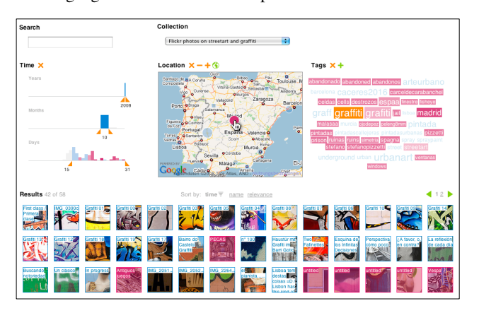
Figure 1: VisGets allow exploration of resources along multiple facets. Hovering over elements highlights relations.

Tag VisGet. The topical composition of the information space is summarized with an interactive tag cloud, in which font sizes indicate relative numbers of information items (Figure 1: Right). Selecting tags defines filters in the topical domain.