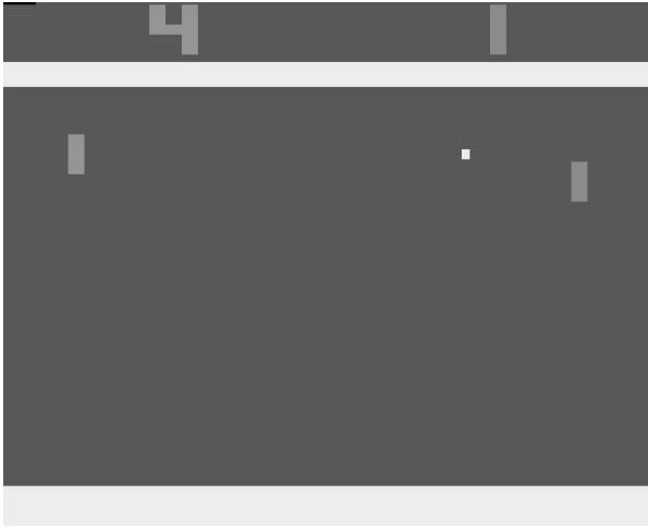
Fig. 3. A Pong screen-shot

general approach to Pong and finally our experiments with this instantiation.