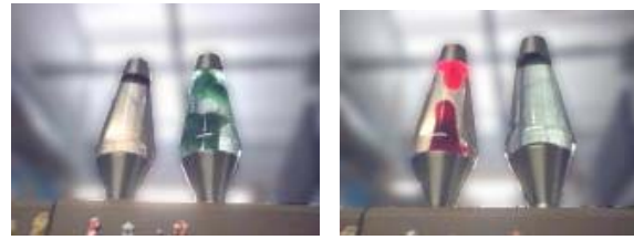
Fig.1 The two Java Lava Lamps used to display the build status.

Savoia [6] has created an ambient feedback device for continuous integration, the Java Lava Lamp . There are two lava lamps involved, one green and one red (Figure 1). The green lamp represents a successful build, and the red lamp a build in which one or more tests have failed. Timing is also significant; because the lamps take a few minutes to warm up, the bubbles mean the lamp has been on for at least several minutes. For a green lamp, this is good, however, bubbles in the red lamp indicates a problem.